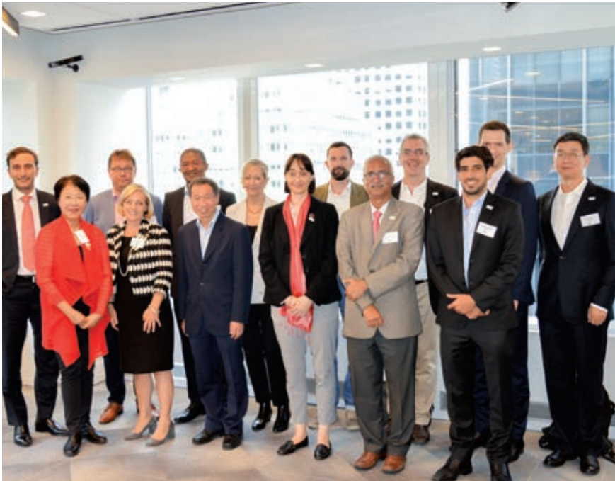
WorldGBC Board of Directors meeting in New York in September 2019.